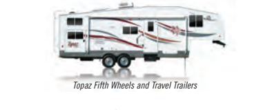
Topaz Fifth Wheels and Travel Trailers