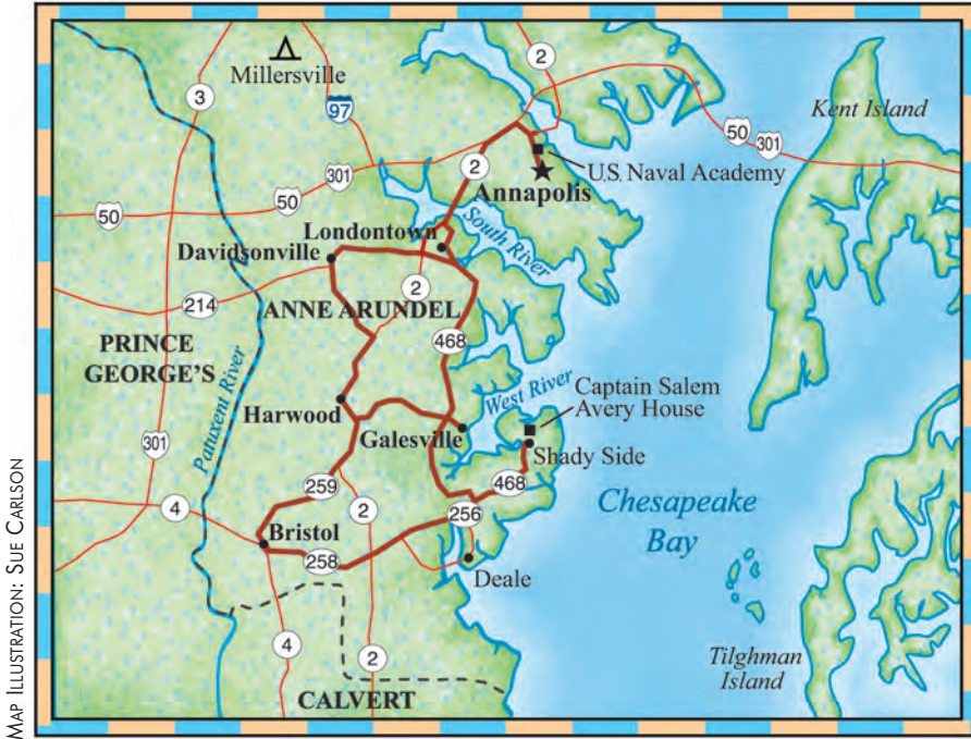
MAP ILLUSTRATION: SUE CARLSON

The two-acre pleasure garden at the William Paca House and Garden in Annapolis features a domed pavilion and Chinese trellis bridge (below). Lord Mayor's Tenement, a reconstructed earthfast structure built with early tools and natural materials, is an important educational aid at Historic London Town and Gardens (opposite, top). The cobblestone streets of Annapolis are lined with more surviving colonial buildings than any other city in the United States (opposite, middle).